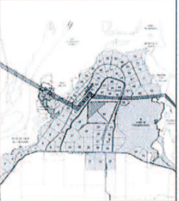
A conceptual map of the park taken from the Green Investment Group website.